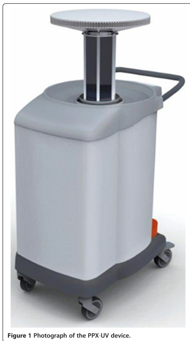
Figure 1 Photograph of the PPX-UV device.

We used a portable PPX-UV device (Xenex Healthcare Services, San Antonio, TX) measuring 30 L × 20 W × 38 H inches (Figure 1). The device is used in empty patient rooms after discharge as prolonged exposure to UV can cause skin and eye irritation. The device used in this study housed a bulb twice as intense as in the device described by Stibich and colleagues [10], and it had new